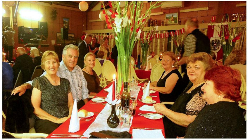
After wonderful food and a couple of drinks some Happy Anniversary! started singing along and ...