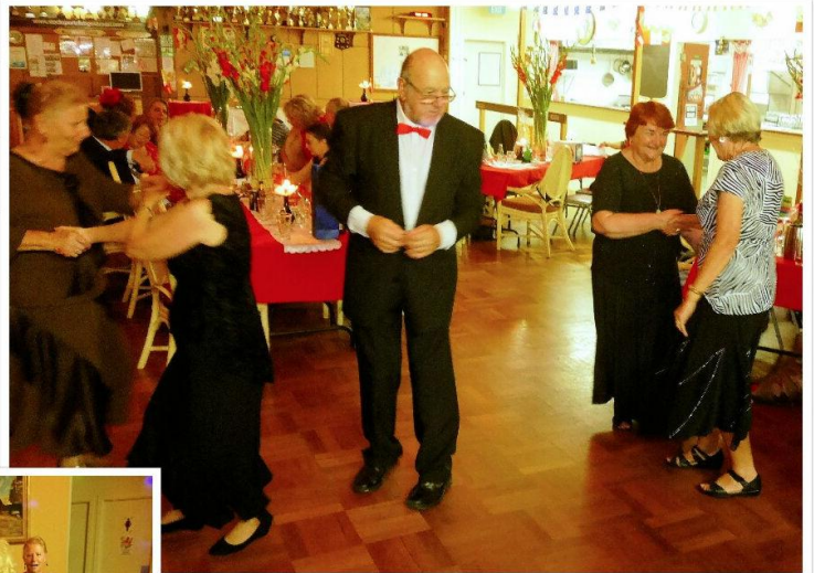
OOF!!! Back on track again!