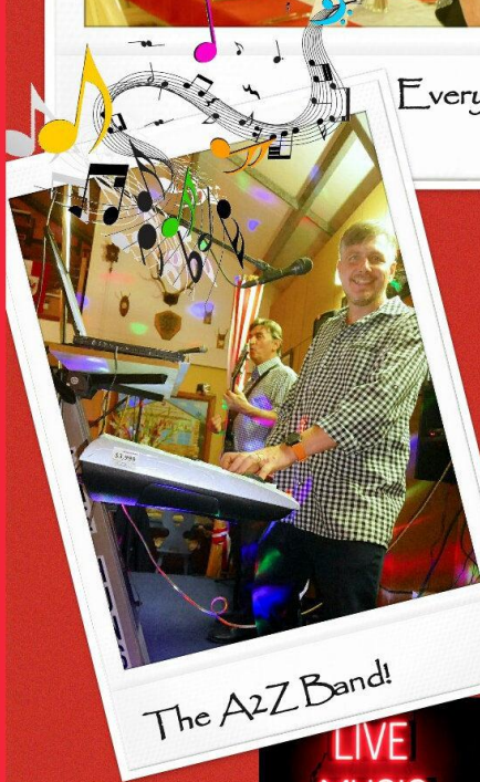
The A2Z Band!