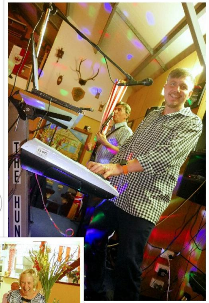
I got the hang of it! It's pretty easy!