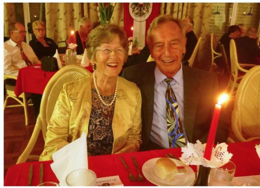
Our invited guests - VIPs from the Gold Coast, Brisbane, Canberra, Adelaide, Morwell/Victoria and Sydney!