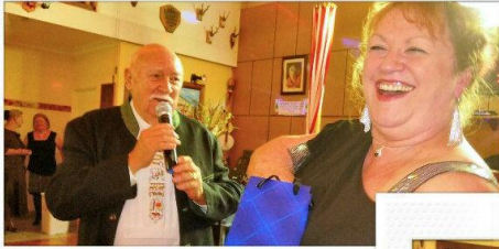
Lots of laughter!