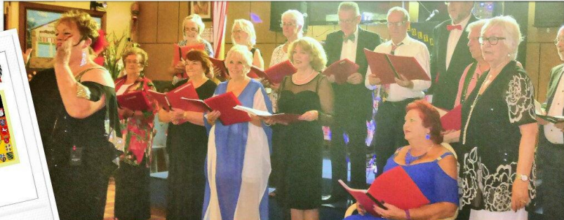
Let's celebrate Our Choir "the SINGKREIS"

We had it all - Beautiful girls (and men), live entertainment, glitz and glamour, lots of fun, great raffle prizes - at our Clubs 33rd Birthday!