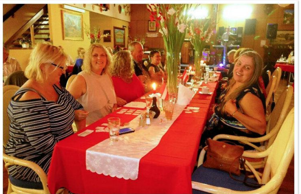
... there was even some "Schunkeln" going on. Translation: a certain rhythmic movement to the beat of a song, people link arms and sway side to side on the spot.