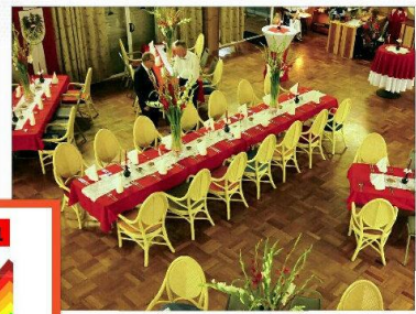
Red, white, and red = Austria