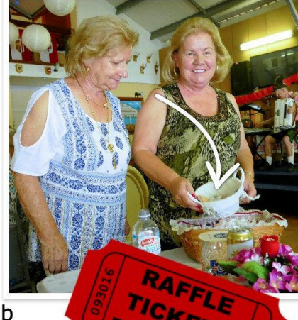
Buy tickets to support our club - you might even be a lucky winner!