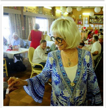
What a clever idea!