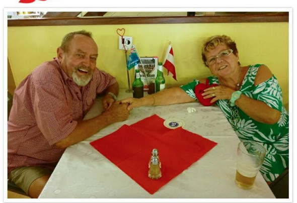
"You don't love someone for their looks, or their clothes, or for their fancy car, but because they sing a song only you can hear." — Oscar Wilde