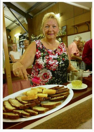
A delicious Schnitzel with Salads or Beef Stroganoff with Rice or Pasta and some homemade bread on top - what else can you wish for ... apart from some yummy cakes and tortes later on ... Bliss!!!!