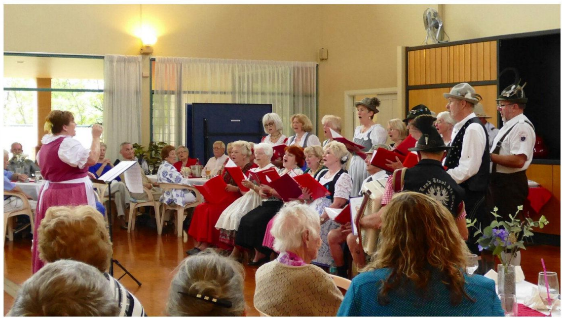
Our choir, the SINGKREIS, performing on the 17th of October 2017 in Robina!