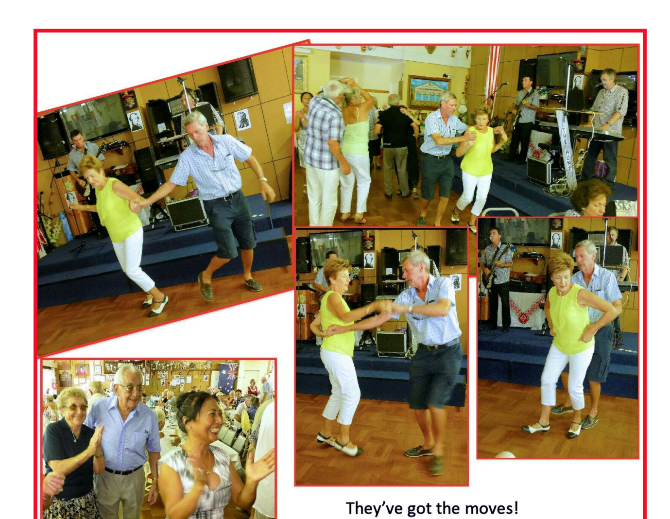
And the audience is enjoying it! Don't look for Happiness – create it!