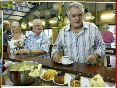
Decisions, decisions .....