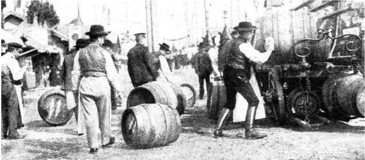
Delivery of beer in 1908