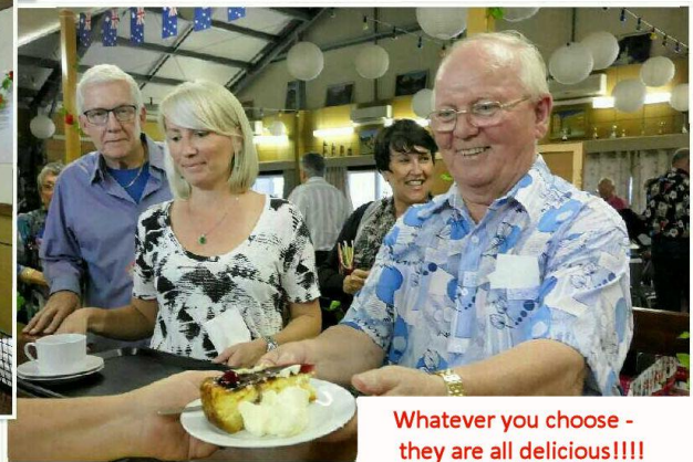
Whatever you choose - they are all delicious!!!!