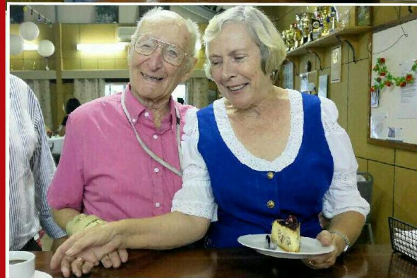
..... you can't go wrong with any of them.