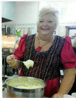
Our big variety of cakes and tortes was much appreciated by our guests.