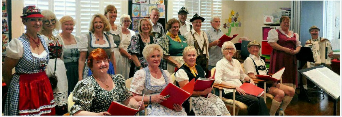
We had a very active audience. They were singing along, swaying to the music and some even learned how to play the bells. We all had a very good time!