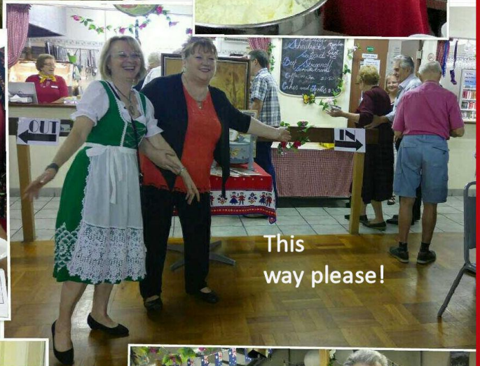
This way please!