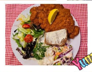
Lunch starts @

12pm 1st choice meal is Schnitzels with salads 2nd choice meal is Roladen with mash & veg or Roast Turkey