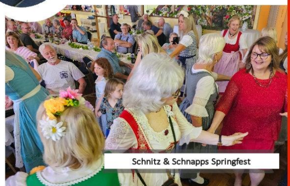
Schnitz & Schnapps Springfest