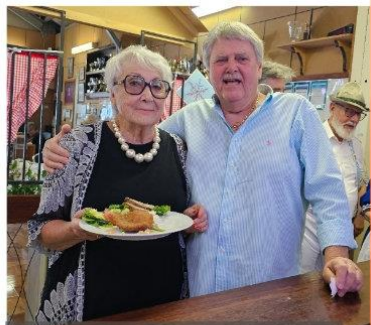
Schnitz & Schnapps Springfest – 15/09/2024