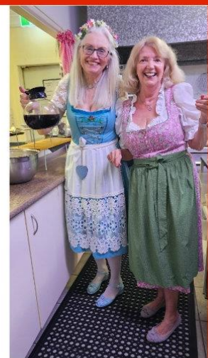
busy - busy - busy !