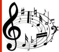
The SINGKREIS, the choir of the Austrian - Australian Club