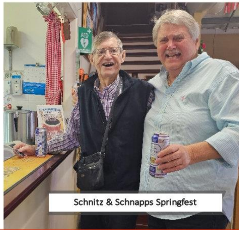
Schnitz & Schnapps Springfest