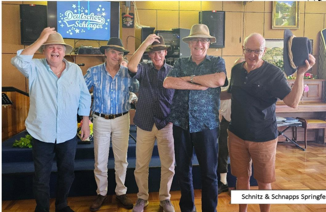
Schnitz & Schnapps Springfest