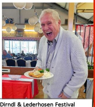
Dirndl & Lederhosen Festival