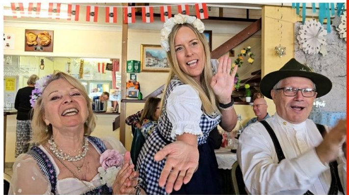
Dirndl & Lederhosen Festival – 04/08/2024