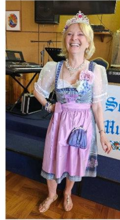
It's a family affair