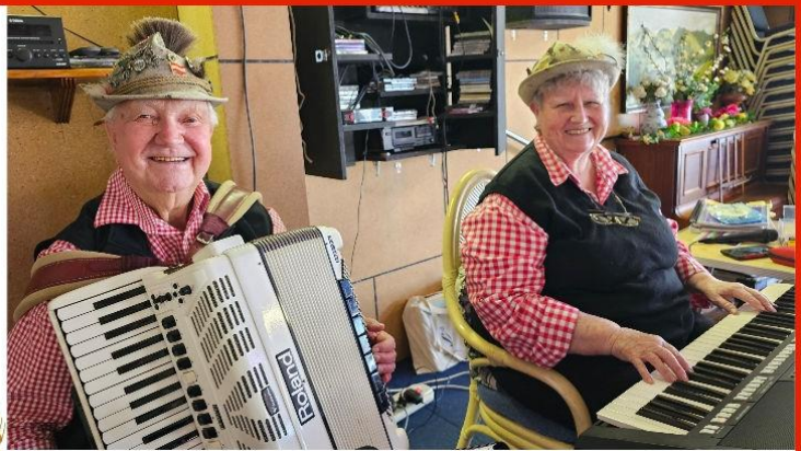
Dirndl & Lederhosen Festival with the ...