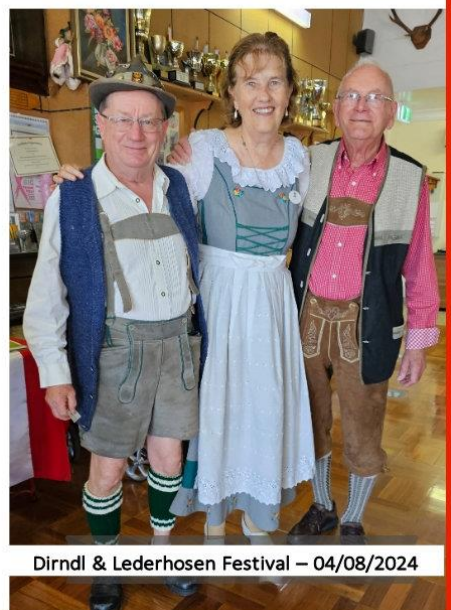
Dirndl & Lederhosen Festival – 04/08/2024

Lederhosen are customary among boys and men all over the German-speaking Alpine region. They are made mostly from deer or any other soft leather that is comfortable to wear.