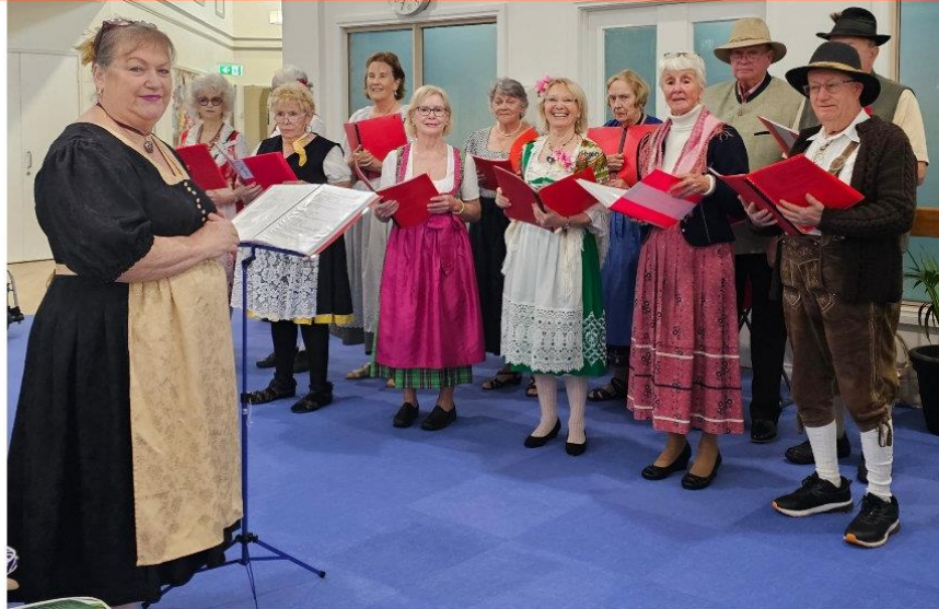
Our choir "The SINGKREIS"

Some photos from our entertainment group who went to the tallebudgera retirement home recently. They loved us all and thoroughly enjoyed the mornings entertainment with us.