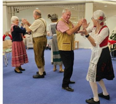
Our FOLK DANCERS