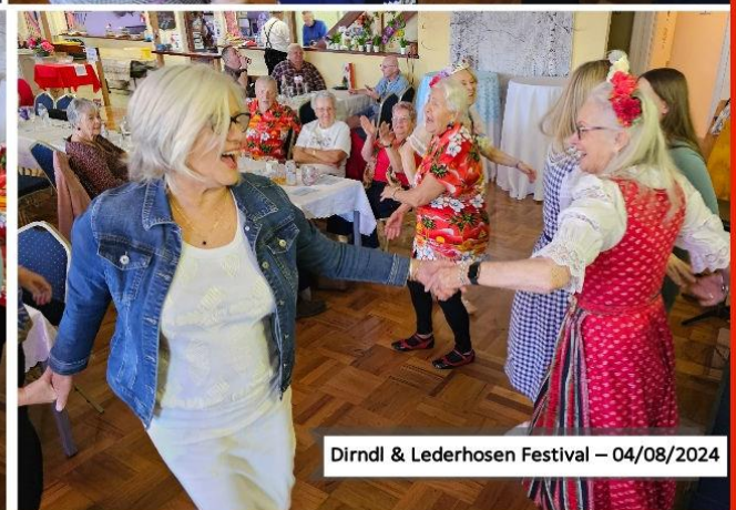
Dirndl & Lederhosen Festival – 04/08/2024