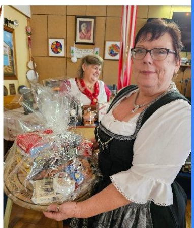
Oktoberfest Festival in Oktober - 01/10/2023