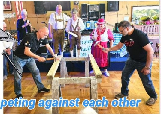
Round 1: 8 participants competing against each other