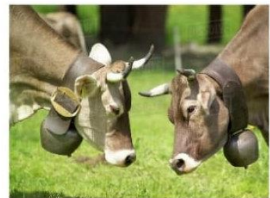
Oktoberfest Festival in Oktober - 01/10/2023

While the cowbell is commonly found in musical contexts, its origin can be traced to freely roaming animals. In order to help identify the herd to which these animals belonged, herdsmen placed these bells around the animal's neck. As the animals moved about the bell would ring, thus making it easier to know of the animal's whereabouts. Though the bells were used on various types of animals, they are typically referred to as "cowbells" due to their extensive use with cattle.