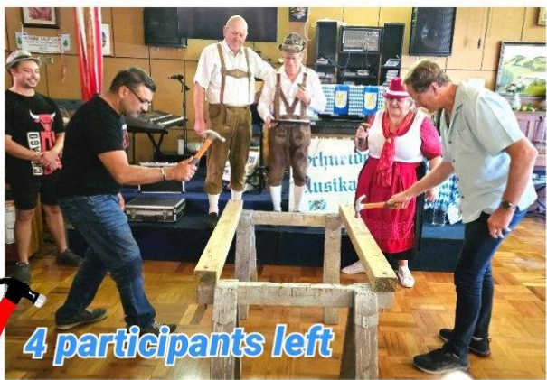
Round 2: 4 participants left