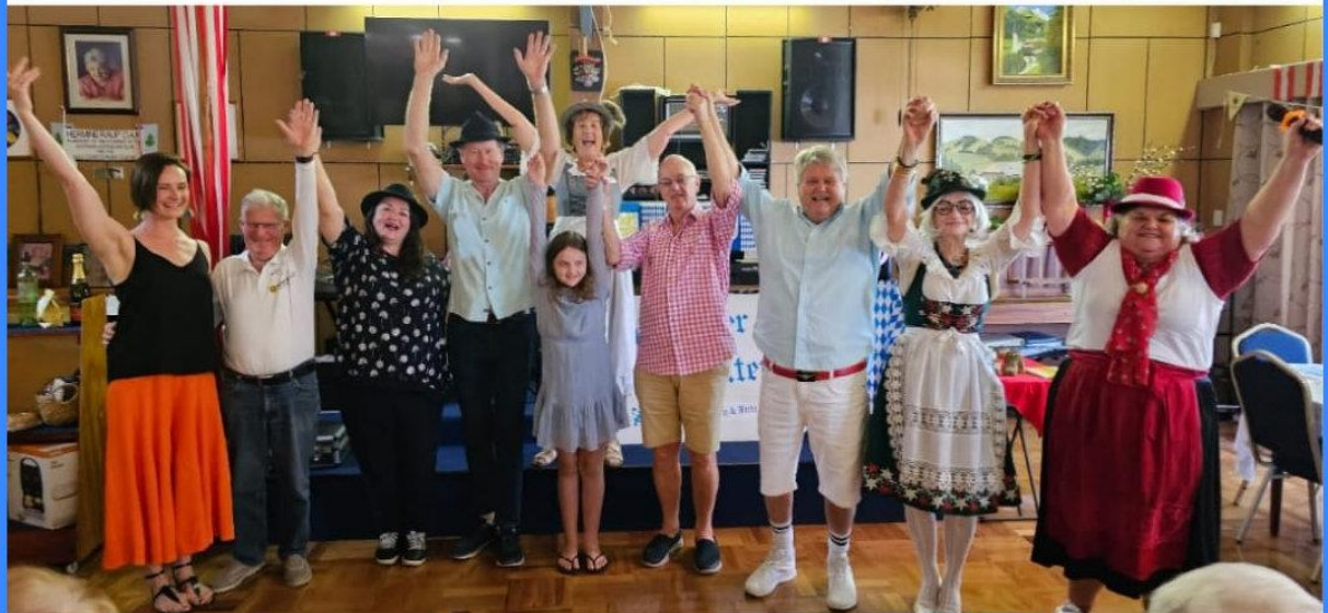
Oktoberfest – Festival in Oktober - 01/10/2023