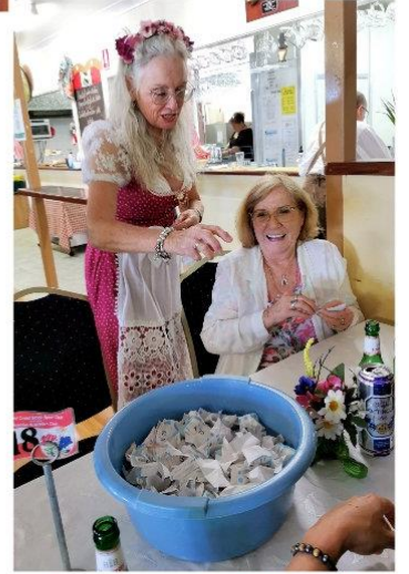
If you would like to give us a hand, please Let us know! Schnitz & Schnapps Springfest - 17/09/2023