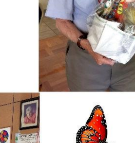
Congratulations to all the winners!