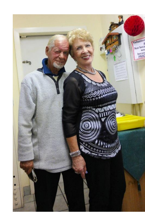
... and after