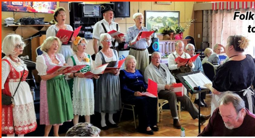
Folk songs to sing along to, performed by ...