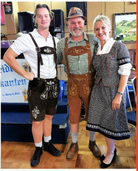
Glühwein Winter Festival 16/07/2023

Are you ready for our DIRNDL & LEDERHOSEN Festival Sun 6th Aug @ the CLUBHOUSE