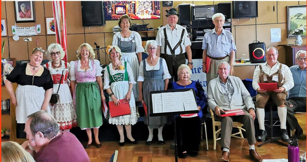
Glühwein Winter Festival – 16/07/2023