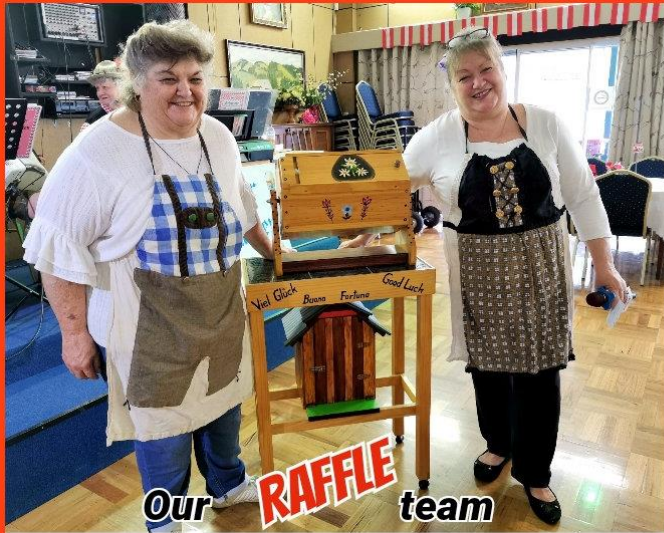
Our RAFFLE team