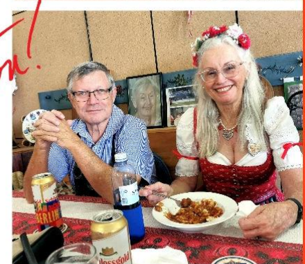
21/05/2023 – Mother's Day Continued