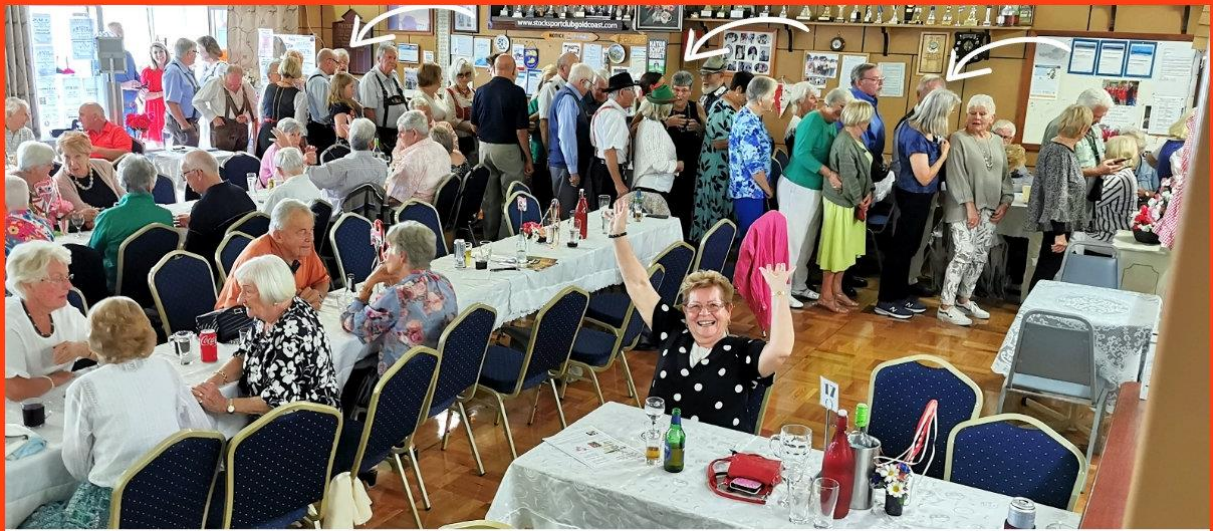
Look at the queue! Time for a chat while waiting to pick up your meal of choice!