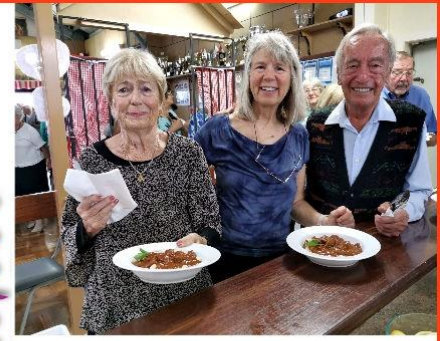
Our SUPER kitchen team! They had to feed 140 guests! Not on easy task. All our staff are hard working volunteers!