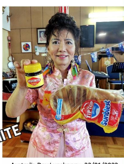
Australia Day Luncheon – 22/01/2023