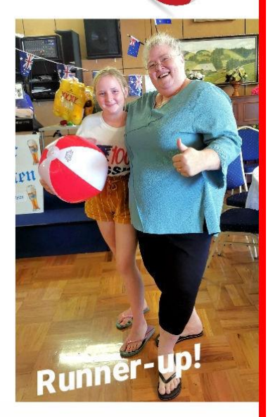
Australia Day Luncheon - 22/01/2023