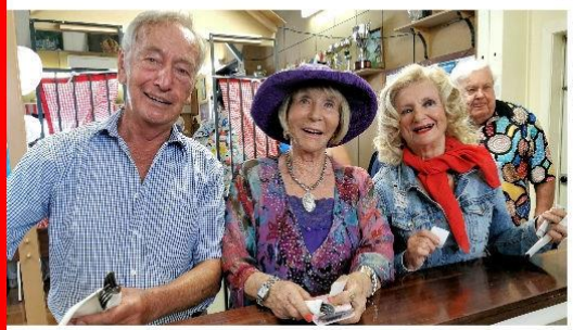
Australia Day Luncheon 22/01/2023

Thank you for dressing up and taking part in all the fun!