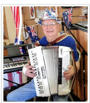
accompanied by Nev,