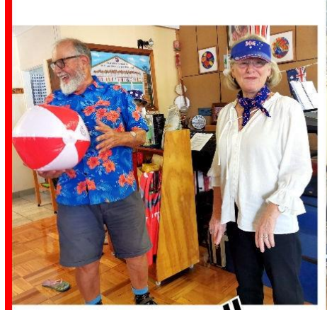
They all had a ball in the true sense of the word!

Challenge: A team of two has to carry the ball between their bodies (no hands!) down the dance floor. The fastest couple wins!