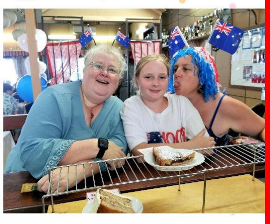
Australia Day Luncheon – 22/01/2023