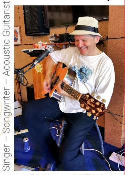
Fashion on the Field 20/11/2022