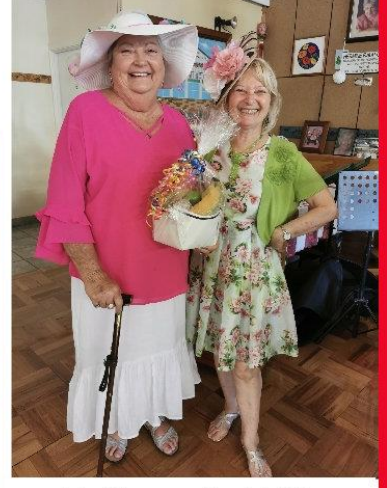
Fashion on the Field 20/11/2022