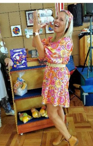
to all the lucky winners!