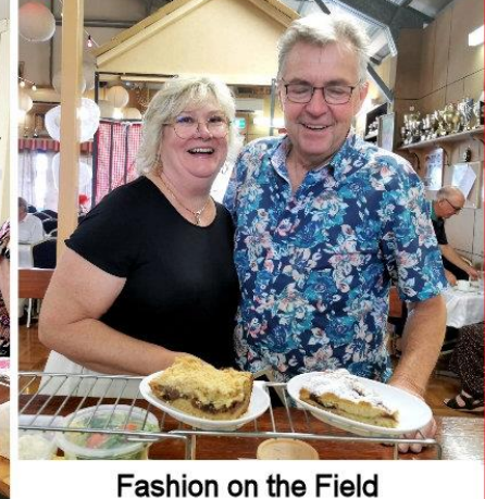
Fashion on the Field 20/11/2022