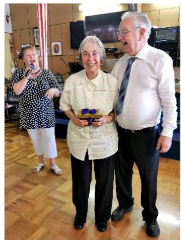
And we had a birthday girl!