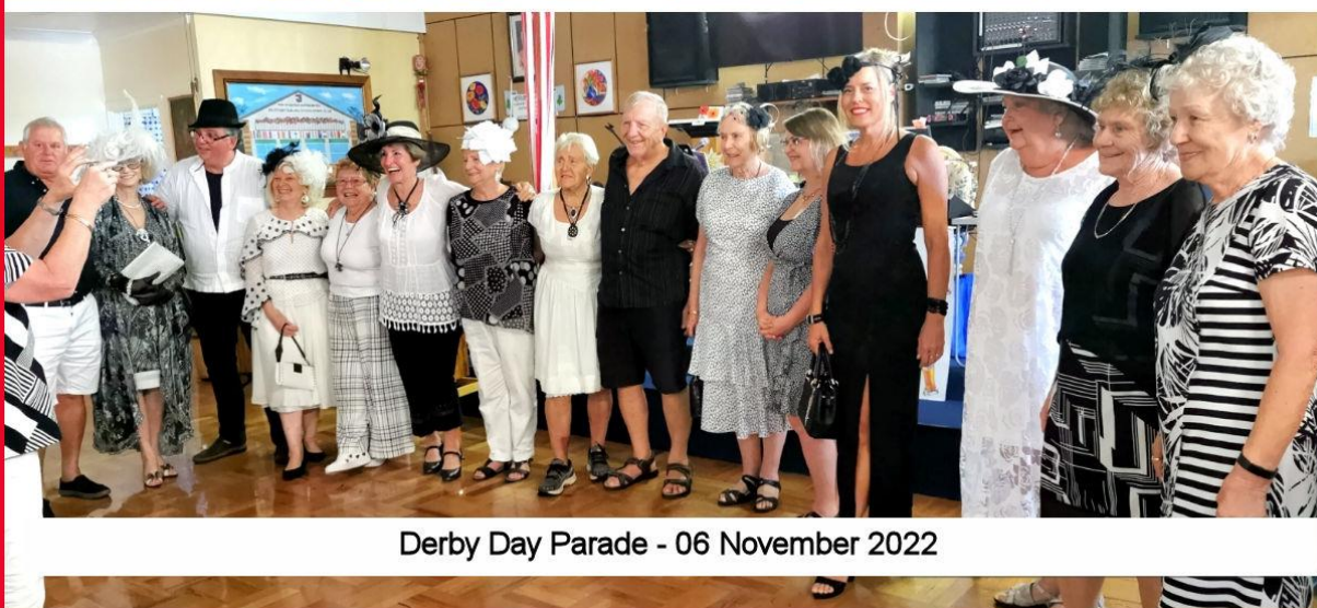
Derby Day Parade - 06 November 2022