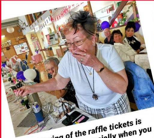
The drawing of the raffle tickets is always exciting, especially when you are a winner!