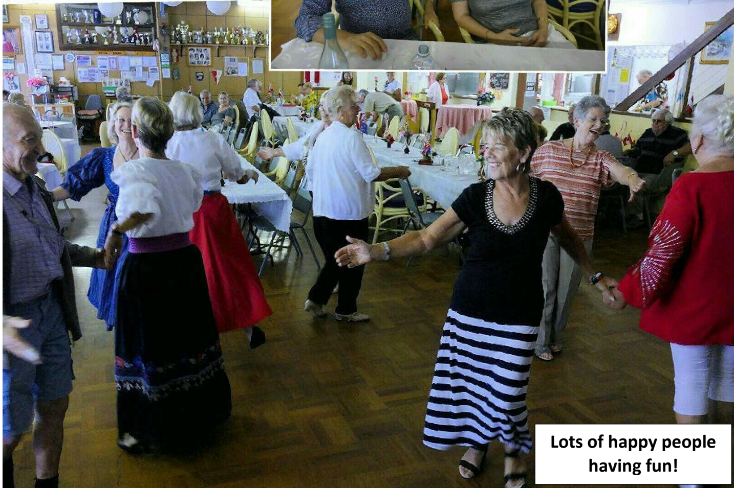
Lots of happy people having fun!