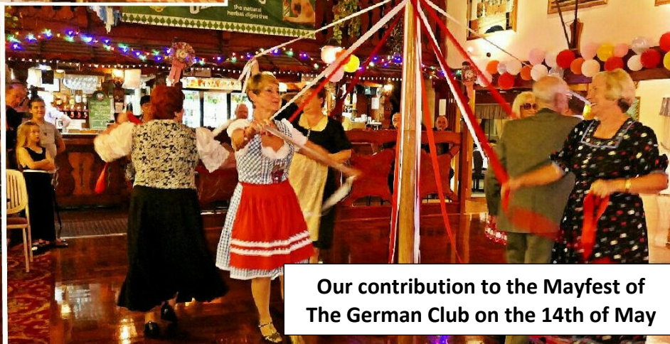
Our contribution to the Mayfest of The German Club on the 14th of May