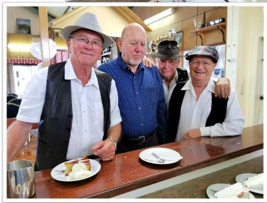
Melbourne Cup Event – 01/11/2022