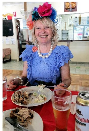
Melbourne Cup Event – 01/11/2022