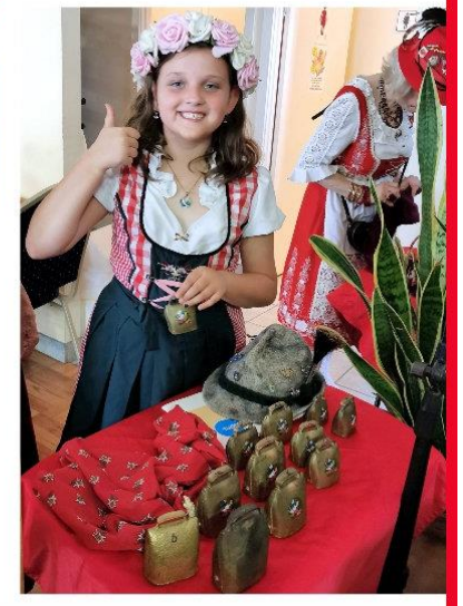
Austrian National Day 16/10/2022