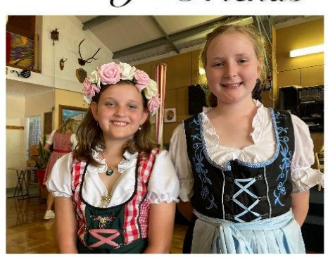
Austrian National Day - 16/10/2022