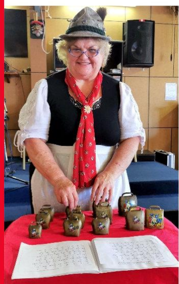
They are always a crowd pleaser!