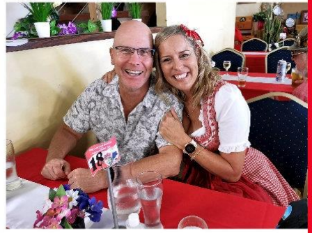
Austrian National Day - 16/10/2022