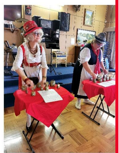
Sooooo entertaining and so much fun to watch!