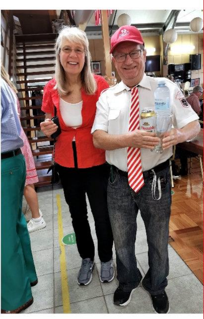
Austrian National Day - 16/10/2022