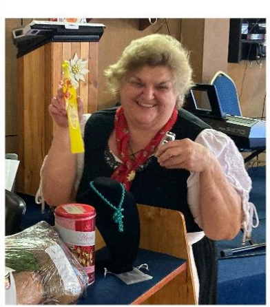
Austrian National Day 16/10/2022