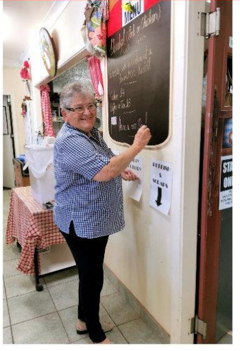
Thank them with a smile or a kind word!