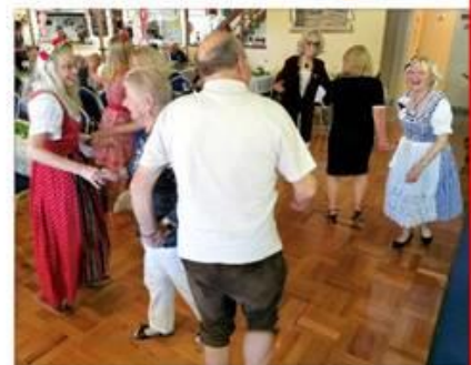
Schnitz & Schnapps Festival 18/09/2022