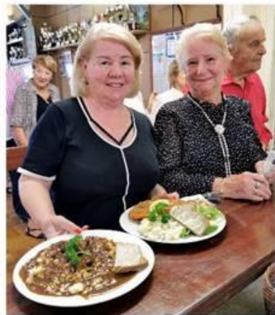
Schnitz & Schnapps Festival 18/09/2022