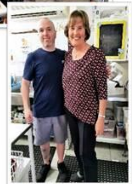
No reason to hide guys, you are awesome!