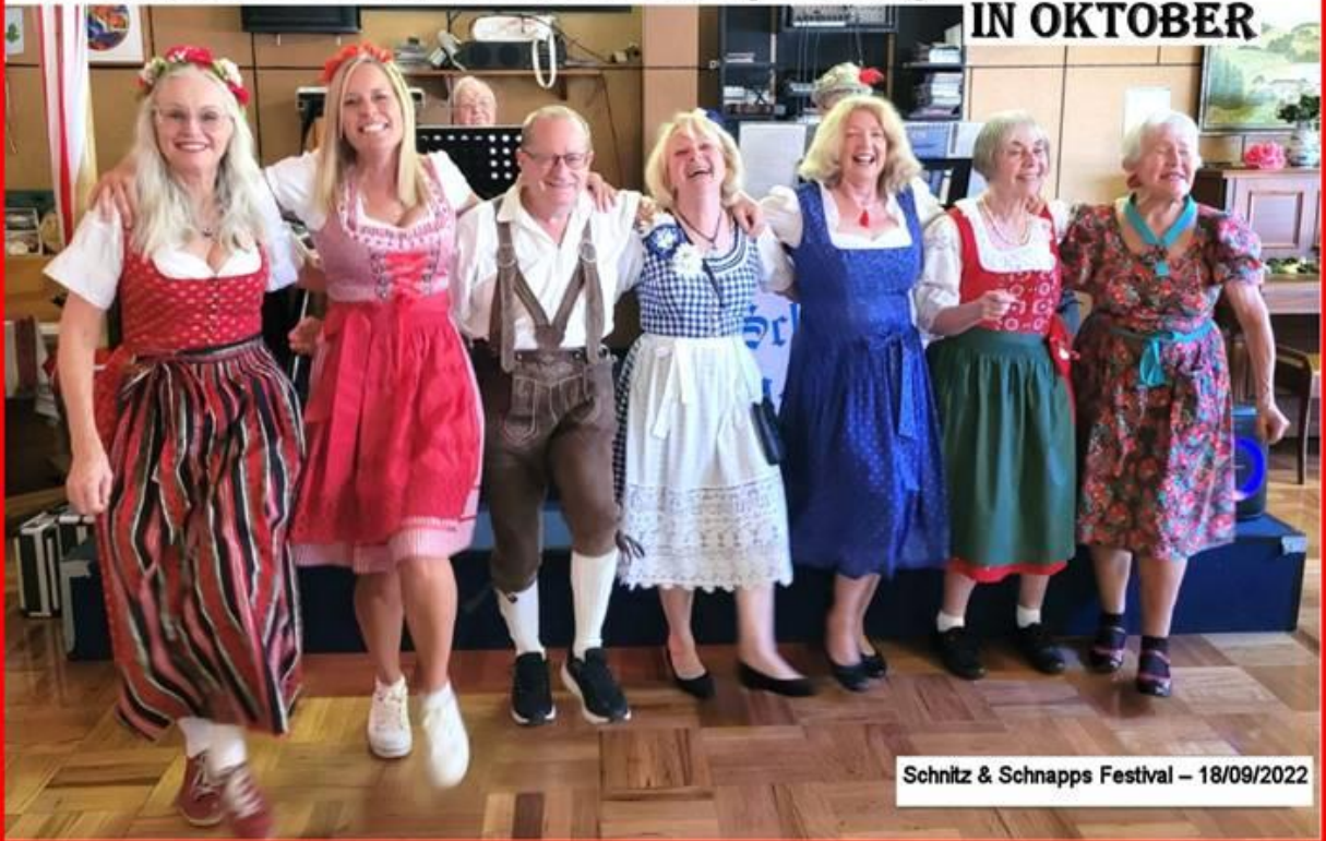
Schnitz & Schnapps Festival – 18/09/2022

... and a dress rehearsal for our upcoming FESTIVAL IN OKTOBER