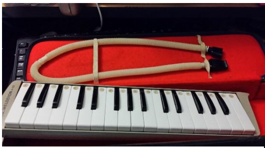
My melodian – bought for me when I was 12

I was about 12 years old when my parents bought me a melodeon, a small keyboard-like instrument that you had to blow into, and before long, I was playing along with Mum and her zither. I remember the first song I learnt was "Schön ist die Liebe im Hafen". As I grew older, I started pestering my parents to let me learn piano but Dad's response (in German) was that "he didn't want to cart a damn piano every time we had to move to another dam site". Although at the time I thought my parents were being totally unreasonable, now as an adult, I can also appreciate that, as the construction camps were miles from any townships, piano teachers were also few and far between.