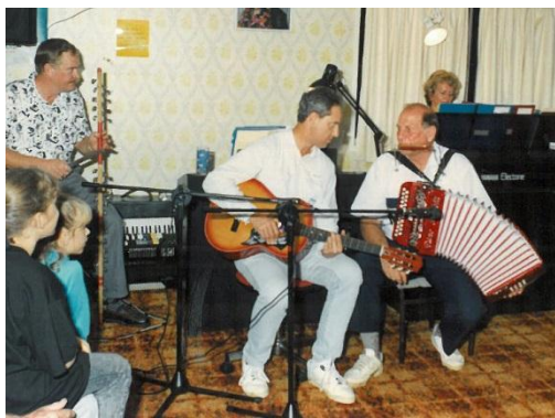
Some of our crazy musos at one of our all night sing-a-long parties

up our repertoire of traditional folk songs.