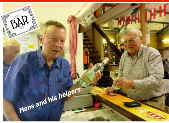
behind the bar ... always happy to serve you!