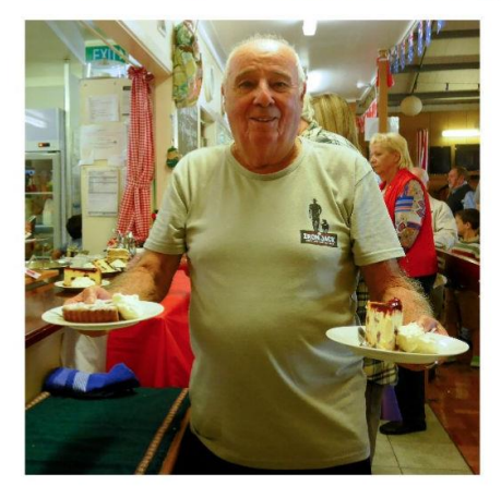
YOU CAN'T BUY AND THAT'S KIND OF THE SAME THING