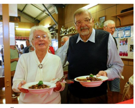
Eat good! feel good!