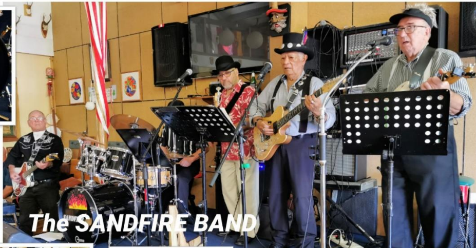
The SANDFIRE BAND