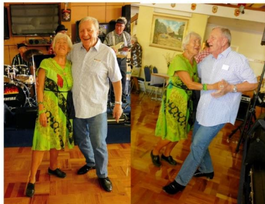
Country Festival Luncheon 07/02/2021