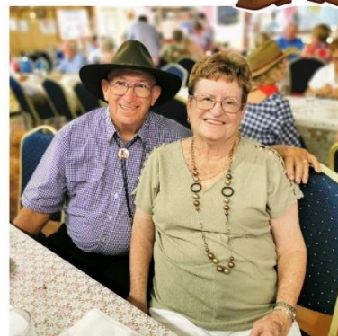
Country Festival Luncheon 07/02/2021