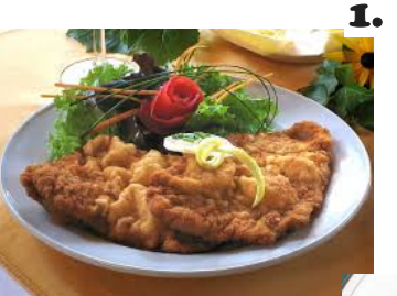
(You will have or gluten free

to order the vegetarian meal meal with your booking.)