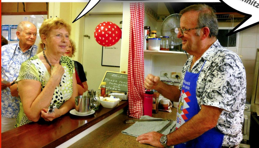
Valentine Returns Luncheon – 16/02/2020

Decisions, decisions! It has been really hard to choose between the two meals! Both mouthwatering!