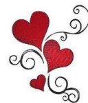
Valentine Returns Luncheon – 16/02/2020

You don't marry someone you can live with – you marry someone you cannot live without. UNKNOWN