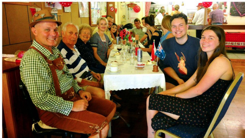
Valentine Returns Luncheon – 16/02/2020