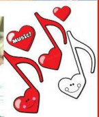
Valentine Returns Luncheon – 16/02/2020