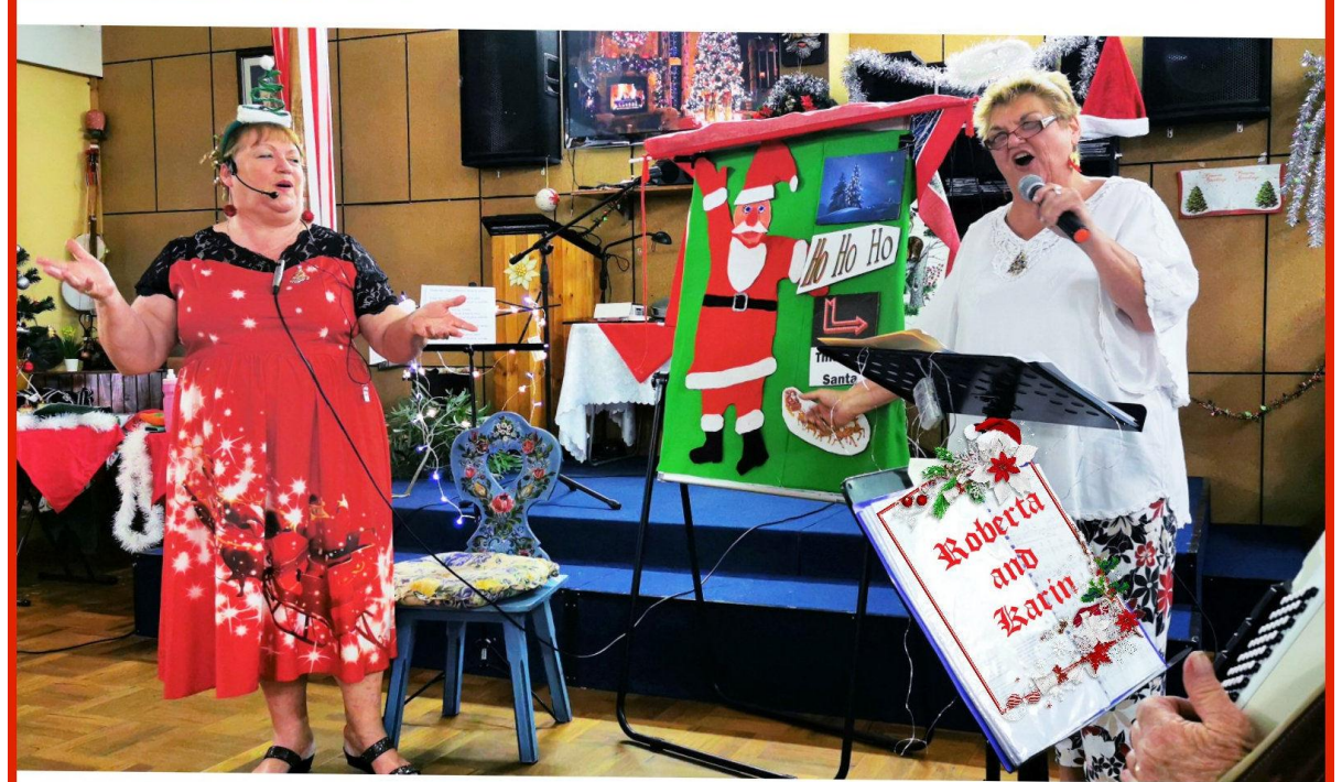
Carols by Candlelight – 14/12/2019