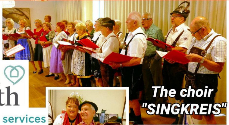
The choir "SINGKREIS"