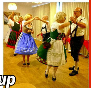
the Folk Dance Group