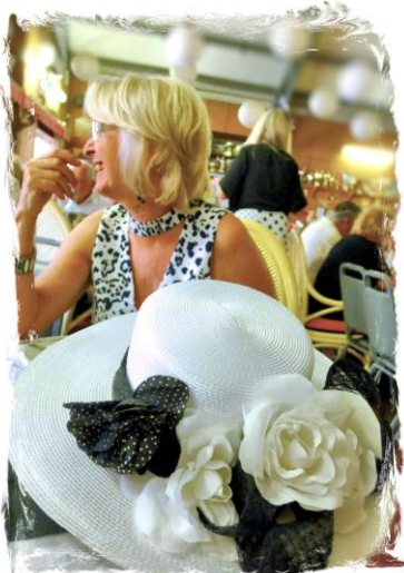
DERBY DAY - 3RD NOVEMBER 2019

Last month has been all about tradition and “Tracht” (our Festival in October and Austrian National Day Luncheon), but this month you can give your Dirndl and Lederhosen a rest.