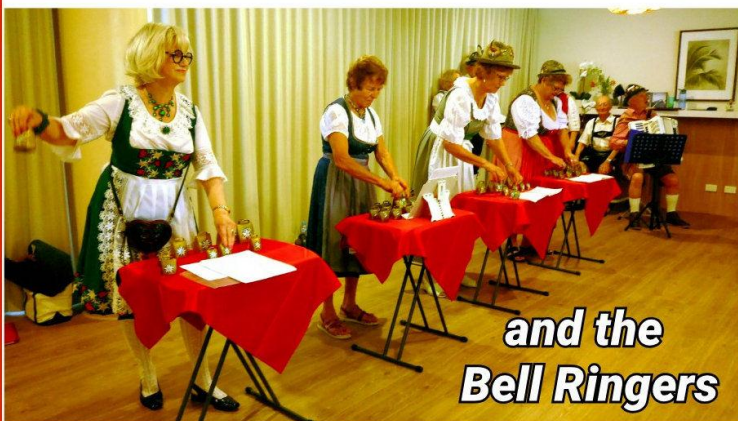
and the Bell Ringers