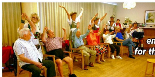
Fun and entertainment for the residents!

Performance of the Austrian/Australian Club 08/10/2019